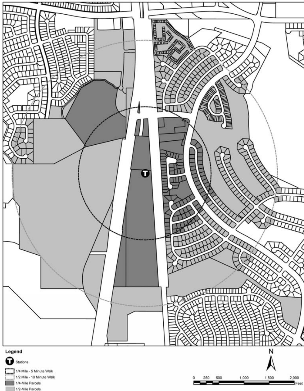
Exhibit 2: Map of Meadow Woods TOD Impact Study Area

A four-part analysis was conducted to determine the fiscal and economic impacts of potential transit-oriented development around Meadow Woods Station in Orange County, Florida. Impacts include future tax revenues from property in the new development within ½ mile of the proposed station, employment and earnings, as well as induced and indirect employment and earnings and the economic impacts of this ½ mile area on Orange and its neighboring counties, including Orange, Osceola, and Volusia. Exhibit 2 shows the general location of the proposed CFCRT station and the study area parcels, with the ½ and ¼ mile radii from the station.