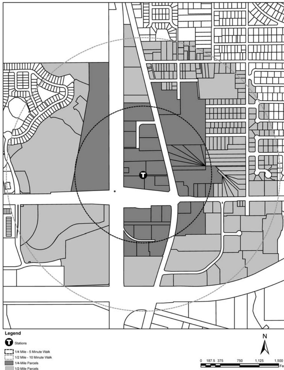
Exhibit 2: Map of Sand Lake TOD Impact Study Area

A four-part analysis was conducted to determine the fiscal and economic impacts of potential transit-oriented development in Orange County, Florida. Impacts include future tax revenues from property in the new development within ½ mile of the proposed station, employment and earnings, as well as induced and indirect employment and earnings and the economic impacts of this ½ mile area on Orange and its neighboring counties, including Orange, Osceola, and Volusia. Exhibit 2 shows the general location of the proposed CFCRT station and the study area parcels, with the ½ and ¼ mile radii from the station.