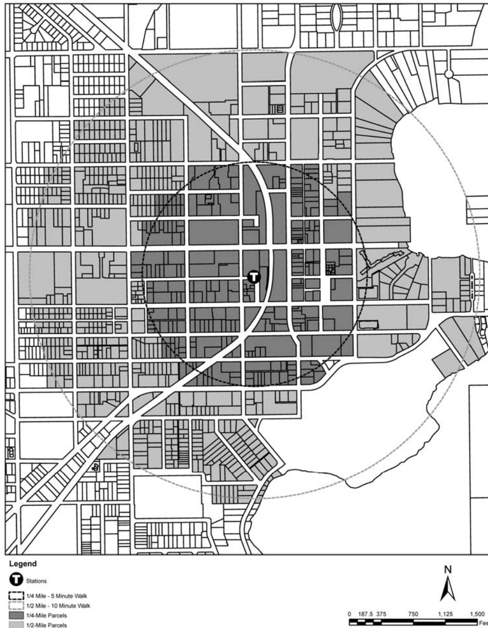
Exhibit 2: Map of Winter Park Station TOD Study Area

A four-part analysis was conducted to determine the fiscal and economic impacts of potential transit-oriented development in Orange County, Florida. Impacts include future tax revenues from property in the new development within ½ mile of the proposed station, employment and earnings, as well as induced and indirect employment and earnings and the economic impacts of this ½ mile area on Orange and its neighboring counties, including Seminole, Osceola, and Volusia. Exhibit 2 shows the general location of the proposed CFCRT station and the study area parcels, with the ½ and ¼ mile radii from the station.